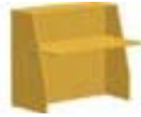
WITH TOP H110 D85