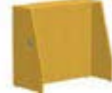
WITHOUT TOP H110 D64